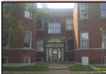
4100 Cleveland #3